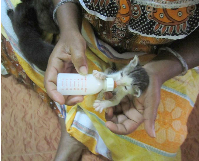
Michie at four weeks

If your kitten prefers to feed away from your body, hold kitten firmly in your left hand. Thumb and index fingers are very useful to extend as braces for kitty's front paws. Some kits so much need this brace that they won't suck unless bracing is possible. (6) When kitten is "in the groove," sucking-wise, it will be perfectly still and stare straight ahead, intensely concentrating. Let it continue that way until it breaks the "spell" itself. Then you can put it back in its carrier or feed the rest of the kits, giving it a second chance at a "top off" when the others are finished. The size of the tummy determines if it has had enough. As mentioned, it should be really round and bulging but not look like it's going to burst! Don't force a kit to drink too much and don't think a kit that is rejecting the nipple at first just doesn't want to drink. Each has a different style and some take longer to get the nipple at the right position for long-term sucking.