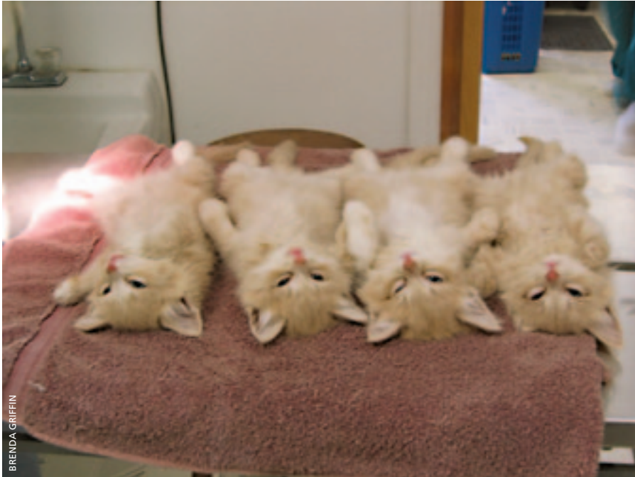
Four male littermates are anesthetized and prepared for surgery. The techniques for performing pediatric spay/neuter are similar to those used in traditional-age patients; special equipment is not required.